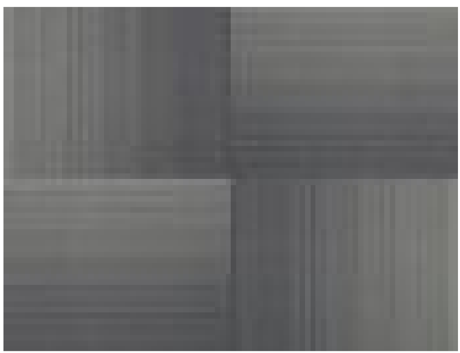
RI 541 GRAY