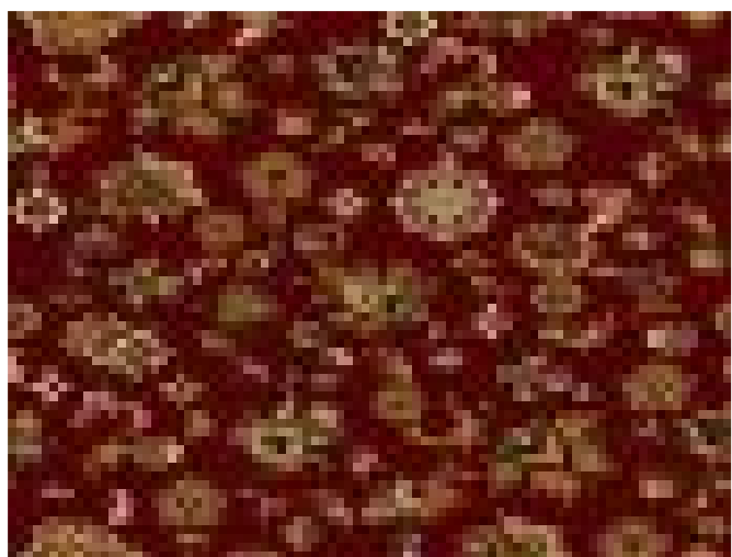
3252 DARK RED